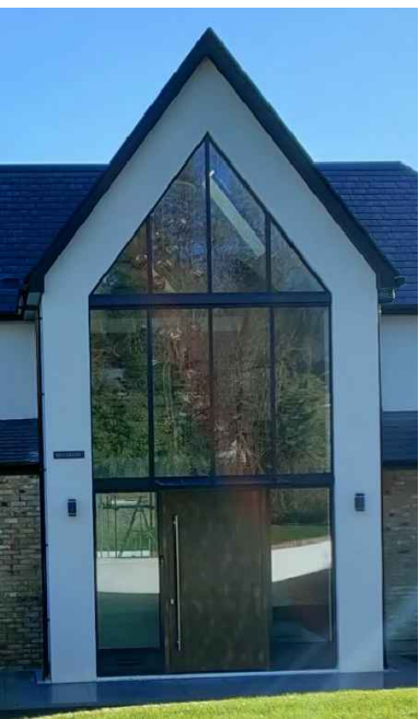
General Style - Look & Feel