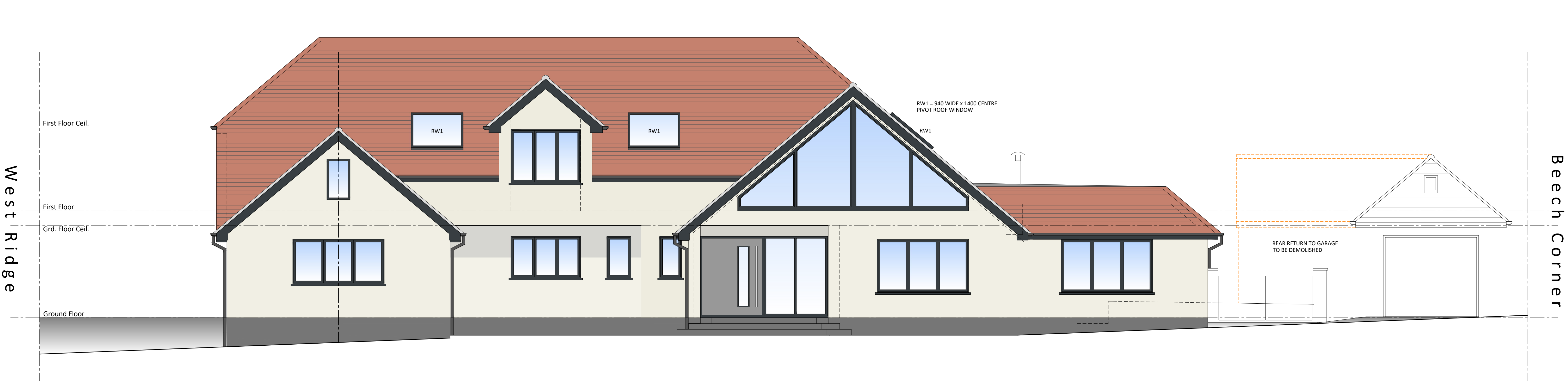
Proposed Front - West Elevation - Coloured to Indicate Materiality 1:50 Scale

Roof Windows - Grey acrylic coated timber framed centre pivot Roof Windows, with triple glazed Argon Gas sealed units (Outer pane Toughened Safety Glass, with Easy-Clean coating, inner pane with Low Emissive coating) - Installed strictly in accordance with Manufacturer's Instructions. To achieve U Value of Maximum 0.75W/m²K